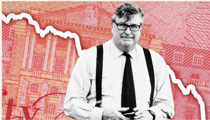
Hedge fund manager Crispin Odey says that his bets against longer-dated gilts have been 'the gifts that keep on giving'

Plus, Odey bets against the UK, emerging market outflows and Lucian Freud's centenary