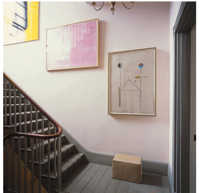
This page, clockwise from top left: the bedspread in the master bedroom is from India, block-printed with images of goldfish and songbirds; the rug was bought in Morocco. Hume's copy of Picasso's portrait of Napoleon hangs over the fireplace; a Gavin Turk bronze cast of a cardboard box sits on the first-floor landing; Kim Meredith designed the marble bath surround in the top-floor guest bathroom. The antique tiles are from a workshop in Lucca. Opposite: the shower in the master bathroom encloses a Gary Hume mural in marble and lead. All but one of the Delft fireplace tiles are original. Visiting Rembrandt's studio in Amsterdam, Hopton was elated to discover that the artist's tiles bore identical motifs. The floor tiles are Moroccan and the fittings are by Catchpole & Rye