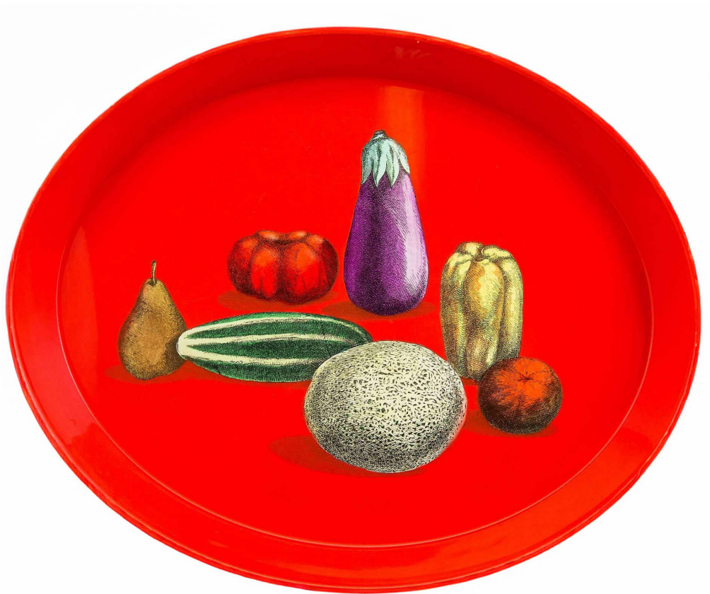
Fornasetti, Verdure su rosso , 1950s, Large transfer-decorated metal tray with fruit and vegetable design by Piero Fornasetti. 50 x 40 x 4.1 cm (19 3/4 x 15 3/4 x 1 5/8 in)

"Curiosity and desire for knowledge led Piero to collect and store things from an early age..."