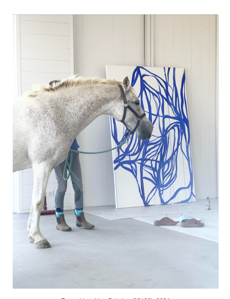
Tanya Ling, Line Painting (05106), 2024 Oil on linen 195 x 130 cm Photograph: Artwork with horse in Tanya Ling Studio, Aoueilles, France

When I'm working there are disciplined moments, and then feral ones. My work combines elements of drowning, elements of flying... for me it's like I'm in the work itself. But the finished work becomes one thing, not many.