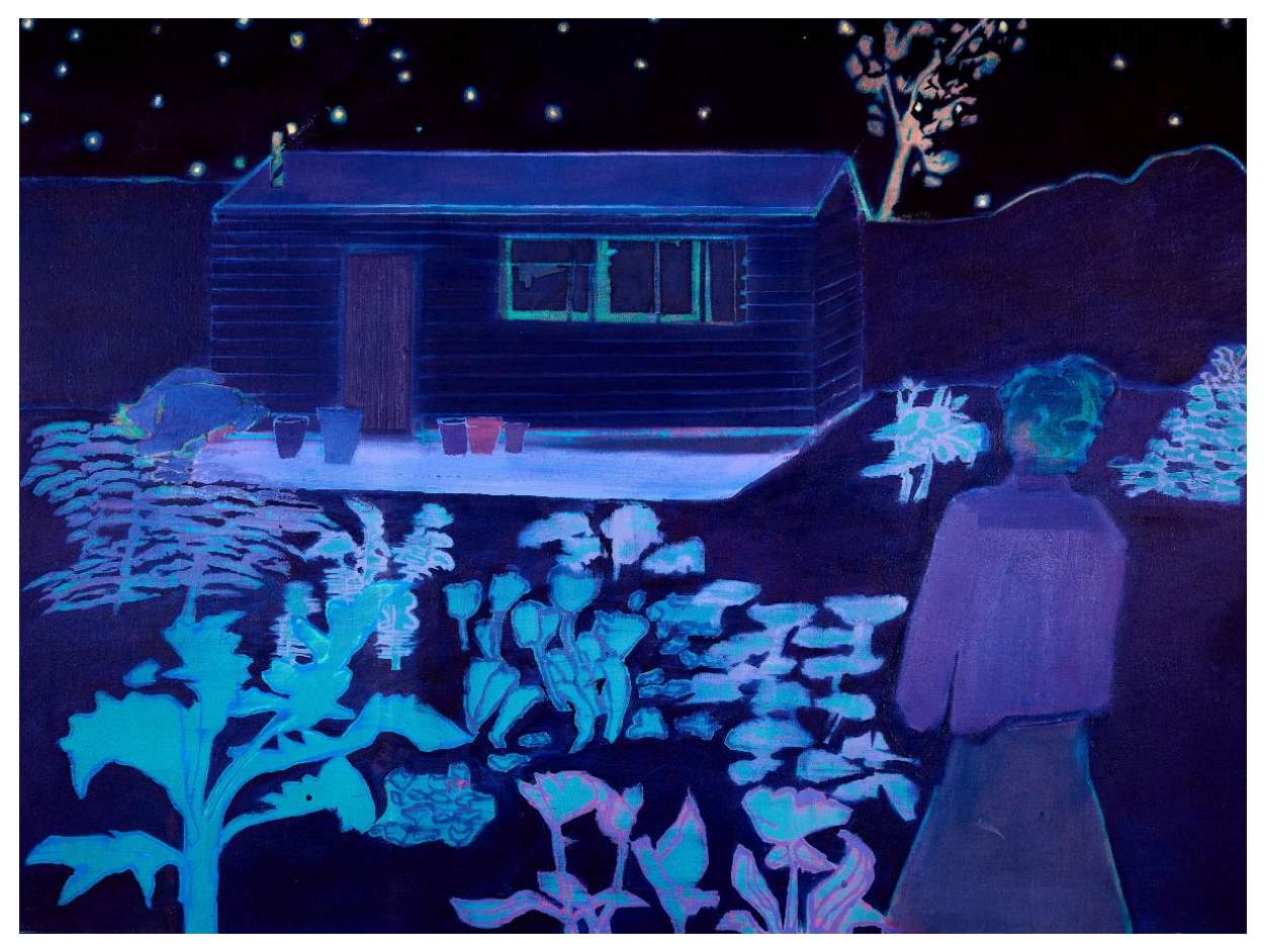
Tom Hammick, Night Garden, 2021

Tom Hammick My Sister's Garden New Paintings, Prints and Drawings 5 April – 6 May 20 Bourdon Street, London W1K 3PL