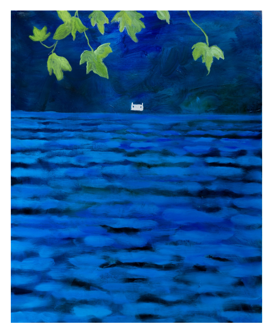
Suzy Murphy, The Song of the Lake , 2023 Oil on linen Signed verso 60 \times 48 in (152.4 x 121.9 cm)